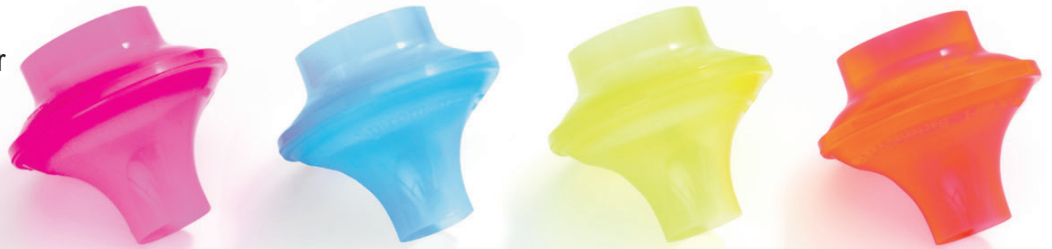
Pulmonary Filters D1010-2

Over 20 Years Experience Producing Quality and Affordable Respiratory and Pulmonary Products